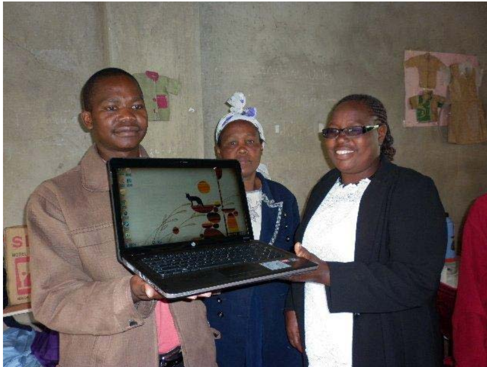
This is your mission dollars at work in the world....